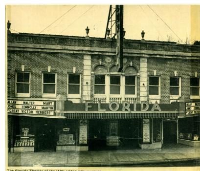
Florida Theatre