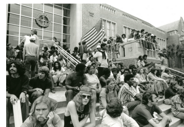
Black Thursday protest